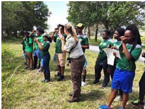
Students and staff participating in WildStem at the Arthur R. Marshall Loxahatchee NWR.