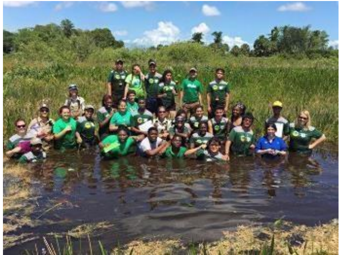
Slogging with the best of them at the Arthur R. Marshall Loxahatchee NWR