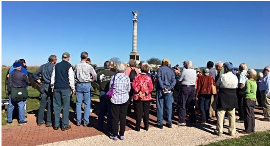
Left: A group of FWS Retirees are being informed on the history and embattlement at the Antietam Civil War battlefield.